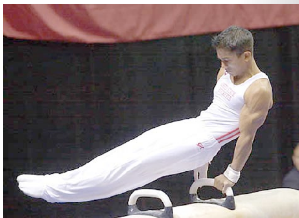
Our use of the term “gymnastics” includes all activities where the aim is body control.

While developing your upper body strength with the pull-ups, push-ups, dips, and rope climb, a large measure of balance and accuracy can be developed through mastering the handstand. Start with a headstand against the wall if you need to. Once reasonably comfortable with the inverted position of the headstand you can practice kicking up to the handstand again against a wall. Later take the handstand to the short parallel bars or parallettes ( http://www.american-gymnast.com/technically_correct/paralletteguide/titlepage.html ) without the benefit of the wall. After you can hold a handstand for several minutes without benefit of the wall or a spotter it is time to develop a pirouette. A pirouette is lifting one arm and turning on the supporting arm 90 degrees to regain the handstand then repeating this with alternate arms until you’ve turned 180 degrees. This skill needs to be practiced until it can be done with little chance of falling from the handstand. Work in intervals of 90 degrees as benchmarks of your growth – 90, 180, 270, 360, 450, 540, 630, and finally 720 degrees.